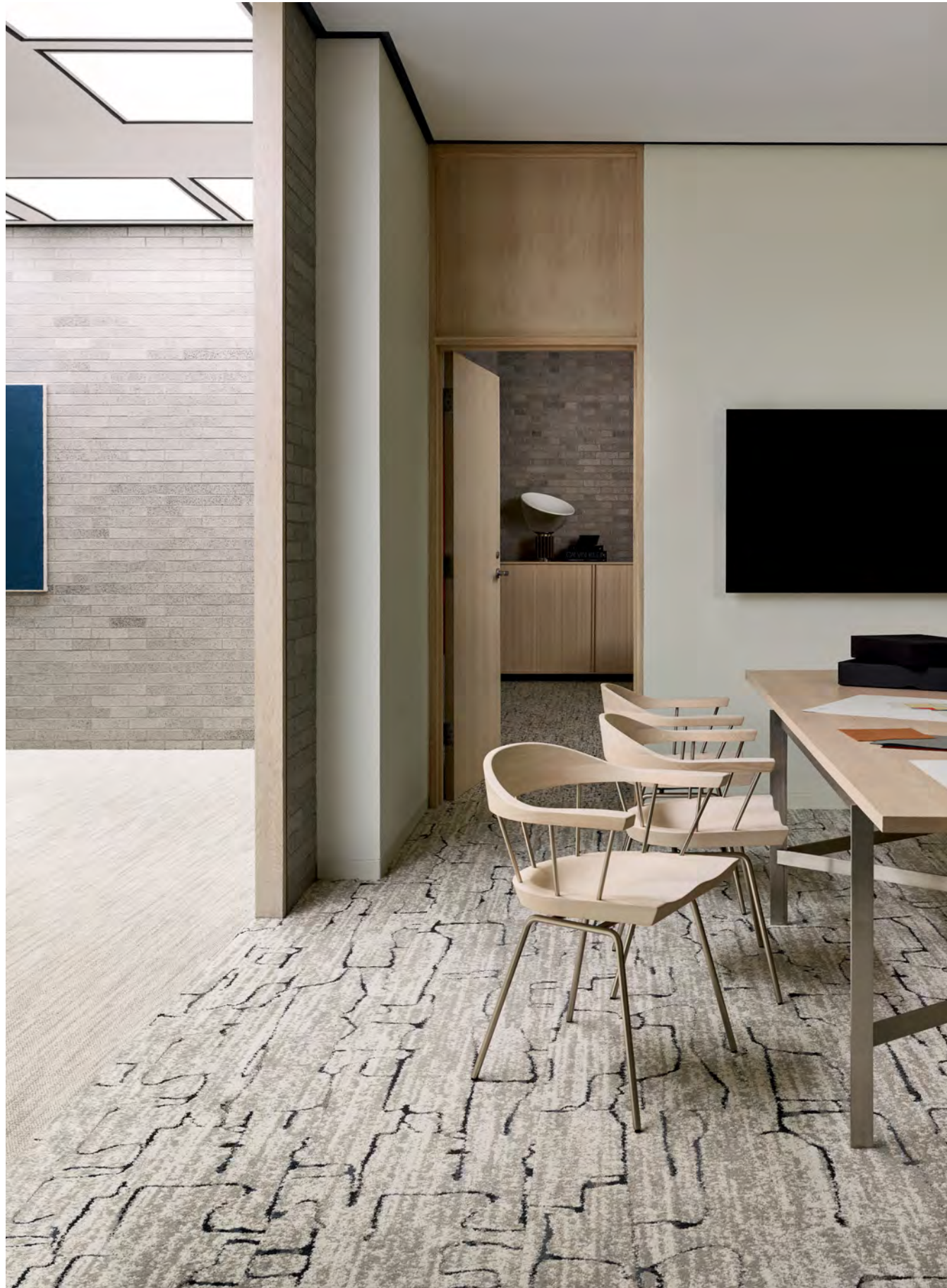
PROCESS (CARPET TILE 5T302) IN ARGAN (01100) AND HEDDLE (CARPET TILE 5T320) IN ARGAN (01100) | INSTALLED STAGGER