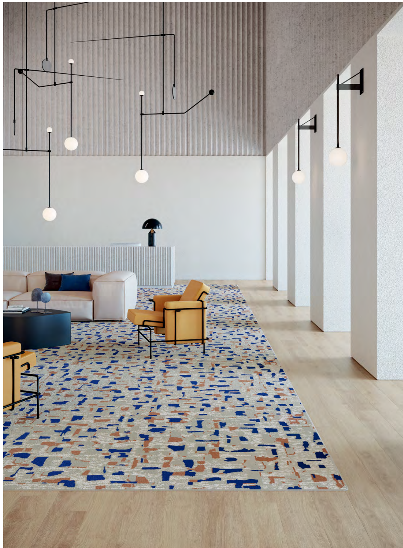
SHARE (BROADLOOM 5A260) IN EMPATHY (01100) | INSTALLED AS A RUG AND INCLUSIVE (COREtec 4068V) IN CHAMPAGNE (68705) INSTALLED STAGGER

Design has the power to build community by creating environments that draw people together in communal spaces. As the needs of the workplace change, and the importance of hospitality grows within communities, these spaces are becoming more flexible, layered and diverse.